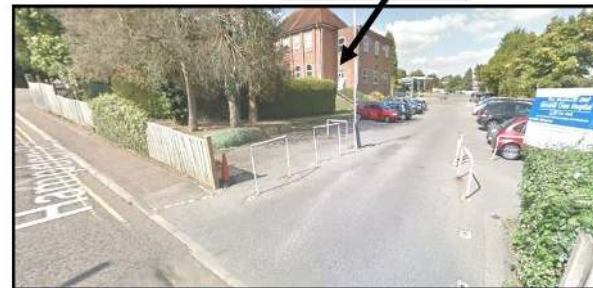
Photo of Chalfont and Gerrards Cross Hospital